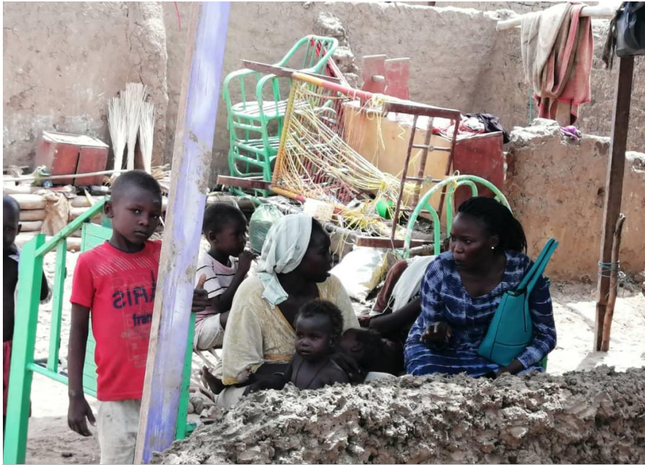
Flood affected families. Yarmouk, Jabal Awliya, Khartoum.