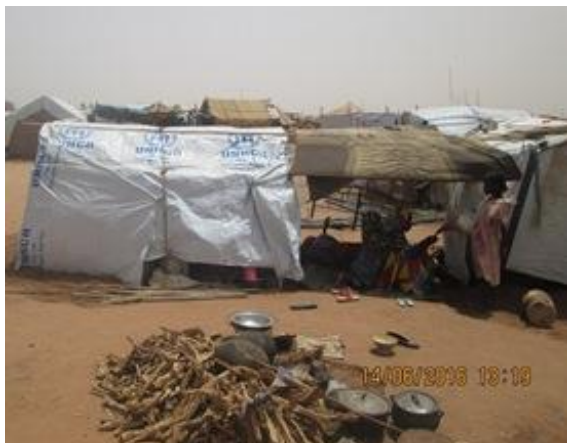
Emergency shelters for newly displaced in North Darfur