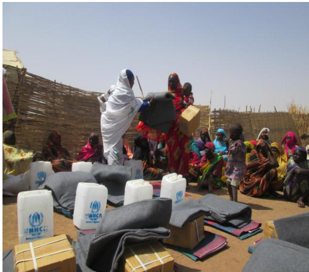
NFIs distribution to vulnerable female-headed households in S.Darfur.