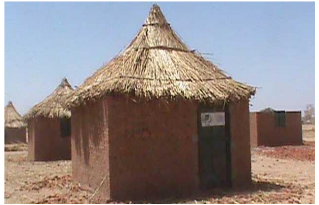
Transitional Shelter Project in Golo , Central Darfur