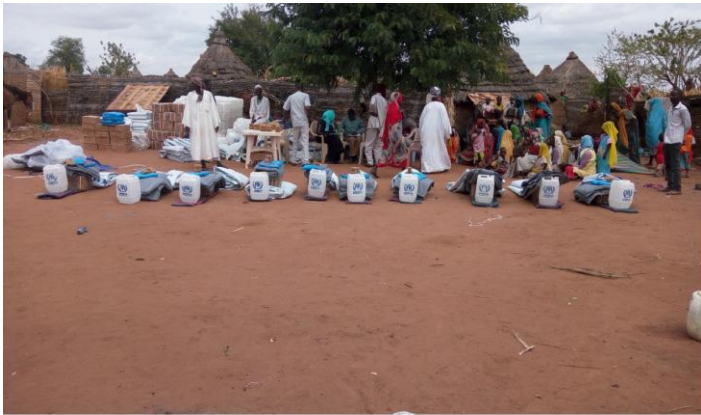
ES/NFIs Distribution in Umdukhon ,Central Darfur