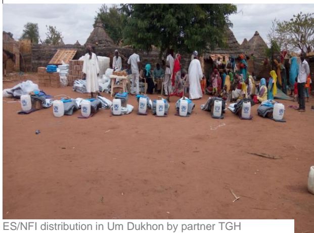
ES/NFI distribution in Um Dukhon by partner TGH