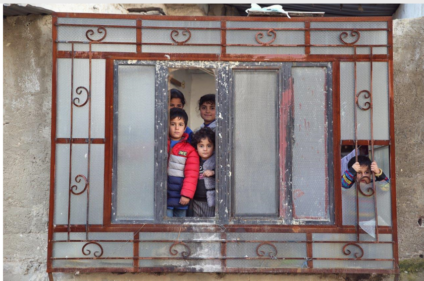
Image to the left: Children checking out the winter distribution (January 2020)