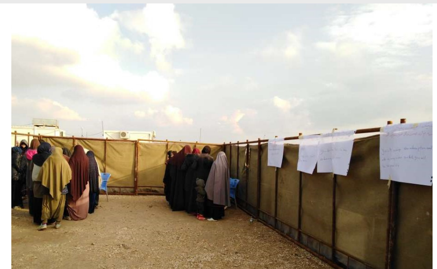
Image to the right: Women segregated lines to register and collect fuel. Safety material on display (January 2020)