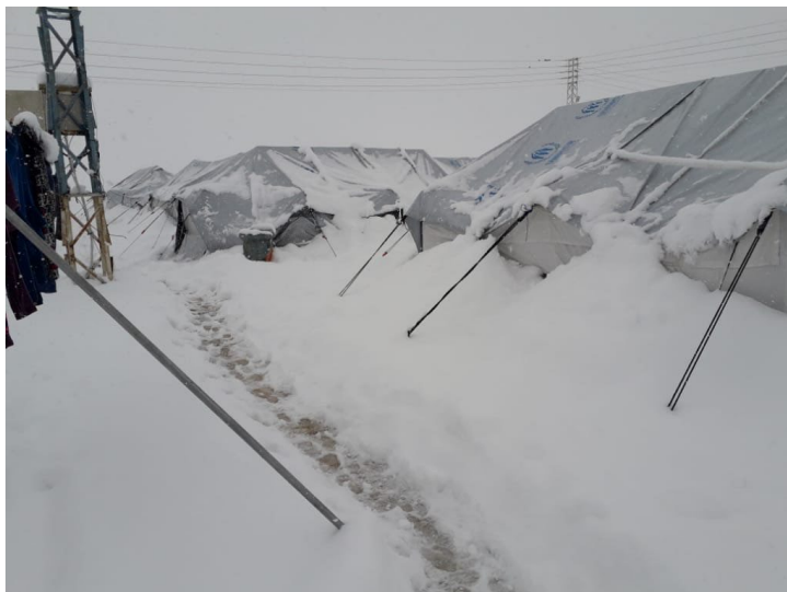
Image to the left: Al Hol Camp after heavy snowfall, with many families reporting severe cold leading to respiratory problems among children especially under 5 years of age (January-February 2020)