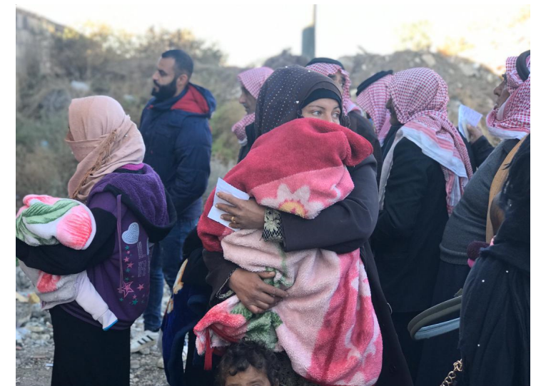
Image to the right: Beneficiaries waiting to collect winterization items after receiving vouchers, Ar-Raqqa (January 2020)