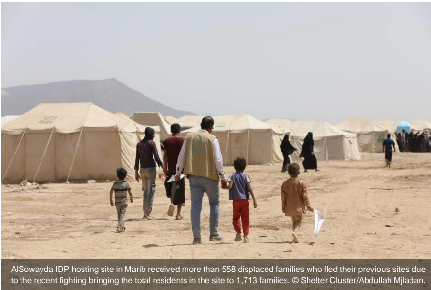
AlSowayda IDP hosting site in Marib received more than 558 displaced families who fled their previous sites due to the recent fighting bringing the total residents in the site to 1,713 families.