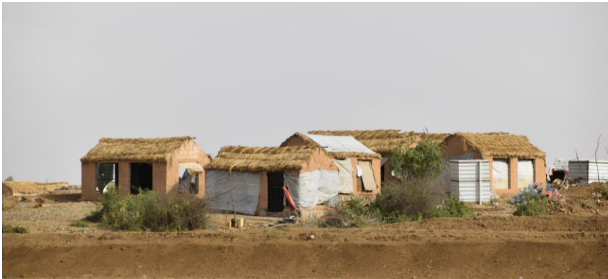
Transitional Shelters provided by Qatar Red Crescent Society to 224 families in 5 IDP hosting sites of Abs district, Hajjah Governorate.