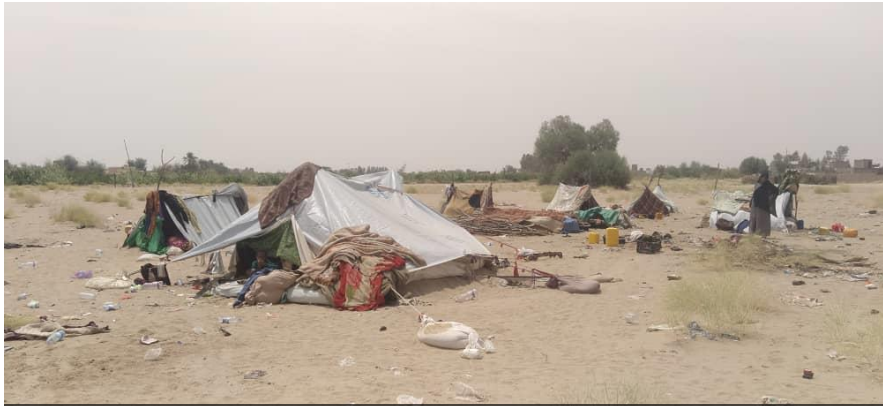
Shelter situation of newly displaced families to Hamam IDP site in Marib Governorate.