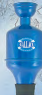
TWC-J1 jazz wah wah