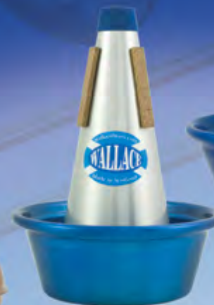
TWC-401F fixed cup