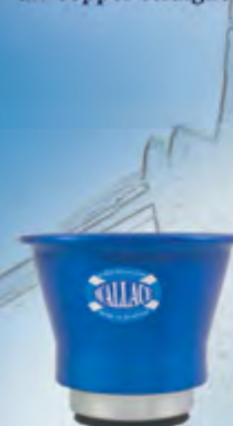
TWC-WA01 wah wah