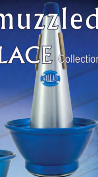
TWC-411 adjustable cup