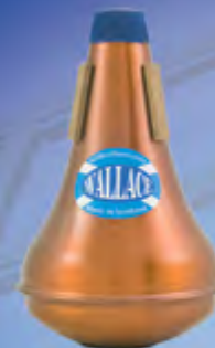
TWC-304 all-copper straight