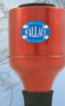
TWC-501 bubble wah jazz