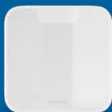
MRCOOL® Smart Wi-Fi Mini-Stat