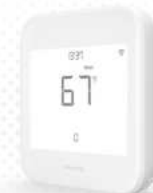
MRCOOL® Heat Pump