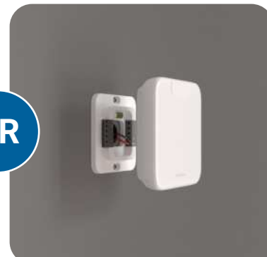
Wall Mount With 24V Hardwire