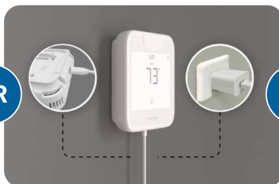
Wall Mount With 5V Adapter