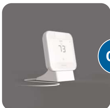
Table Stand With 5V Adapter