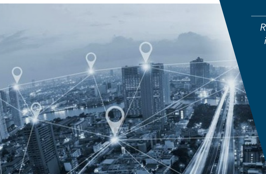
Contains OS data © Crown copyright [and database right] 2019

Rigorous validation of data entered into the National Gazetteers ensures complete confidence for teams using the information.