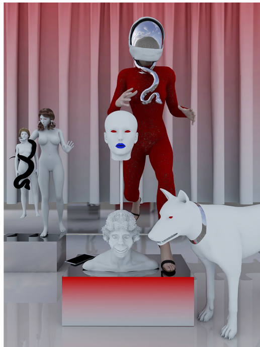
Olga Fedorova, White Dog , 2017. Lenticular print, unique