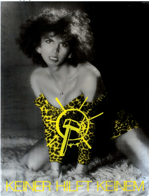
Jörg Schlick, Nora, I'm a shaver, I like your mooshy, I'm Schlick (politisch ziemlich korrekt), 1994, serigraph on polystyrene mirror mounted on wood, edition 9 (+ 3) ed. Artelier, Graz