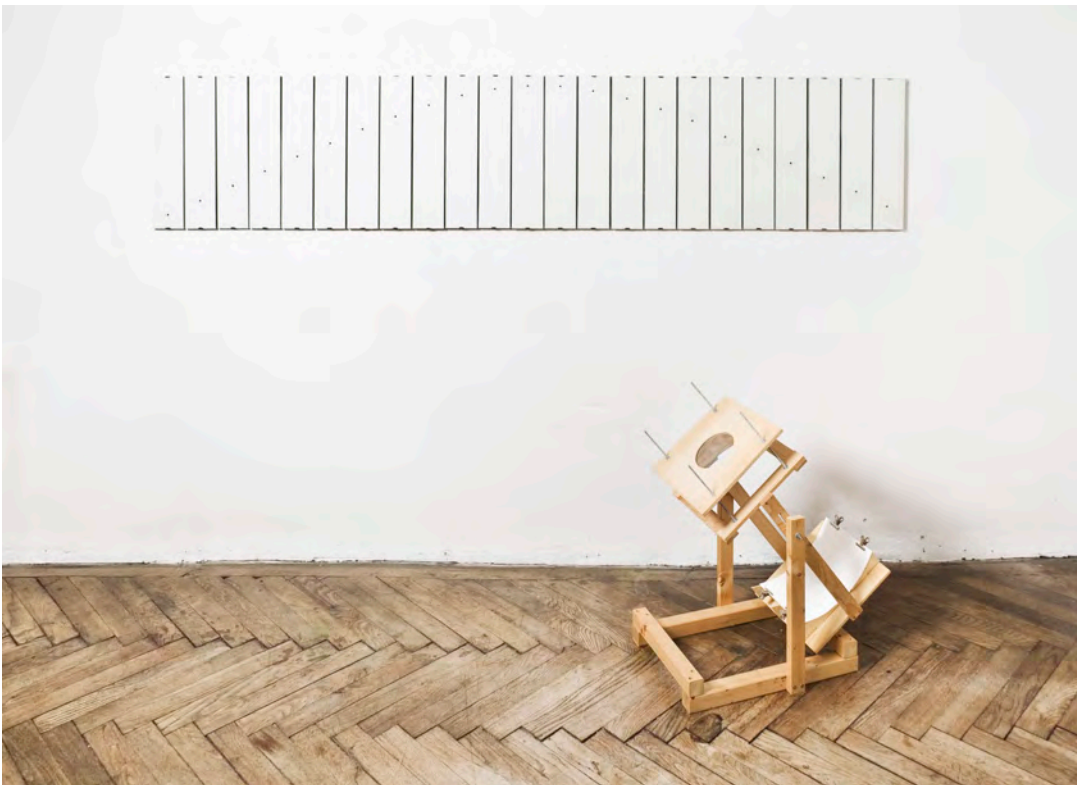
Ulrike Königshofer, Sonnenlichtaufzeichnungen, 2014. Installation