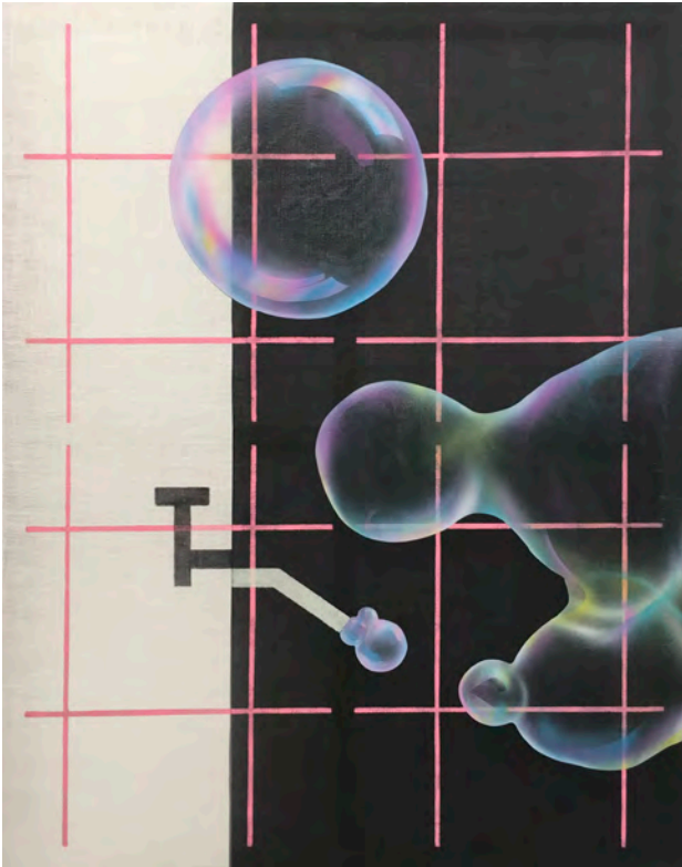
Maja Vukoje, Bubble, 2017, acrylic paint on burlap, 190 x 150 cm