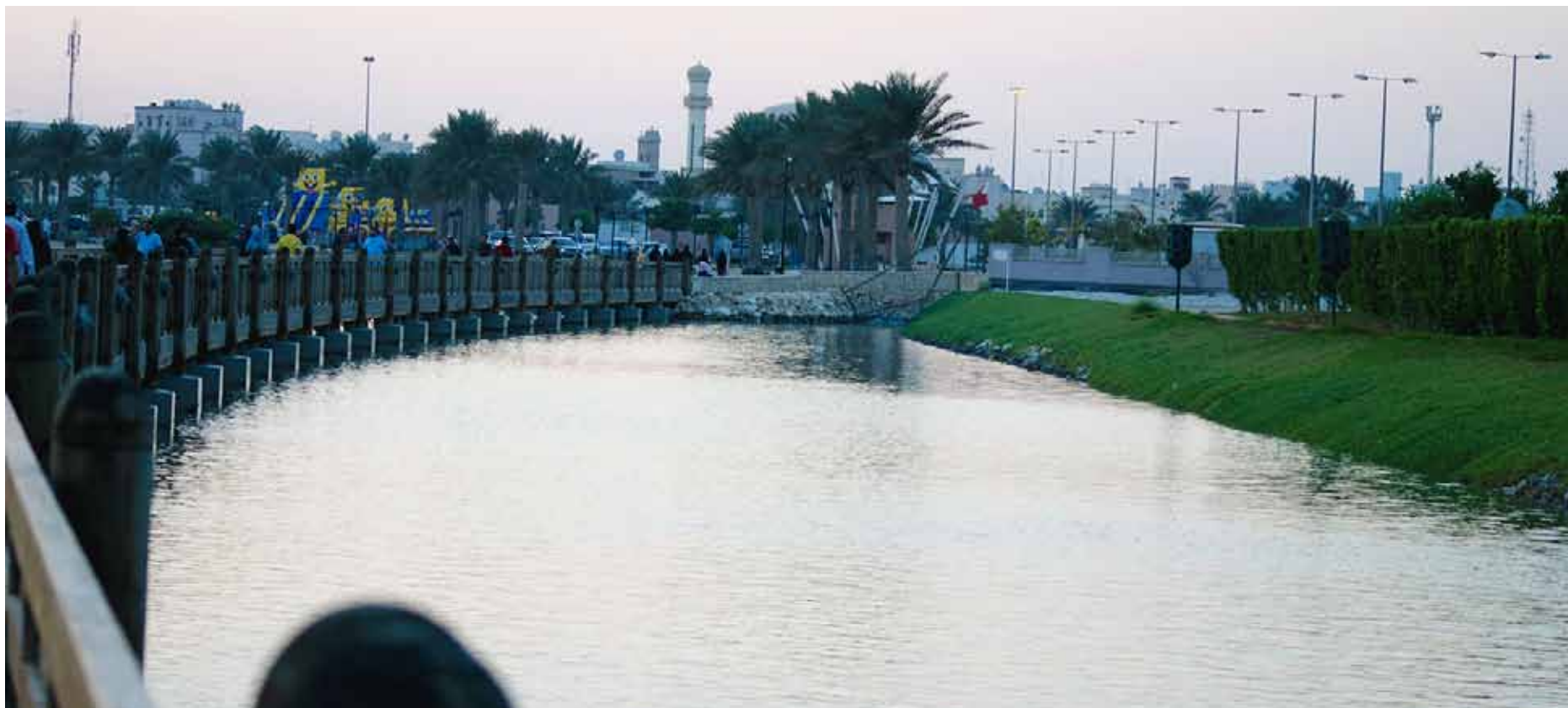
Figure 13: Landscape design and seasonal planting are a routinely managed in the site.

These citizens attend town meetings, monitor elections, volunteer at schools, and contribute to bettering society. The rise and spread of new democracy in Bahrain has made the people not only possible, but absolutely necessary. Through their civic engagement, people help society grow; they hold their government to standards of accountability, transparency, and responsiveness. This emerging sector has been growing at an unprecedented rate over the last three decades and is reorganising the way the work of society gets done.