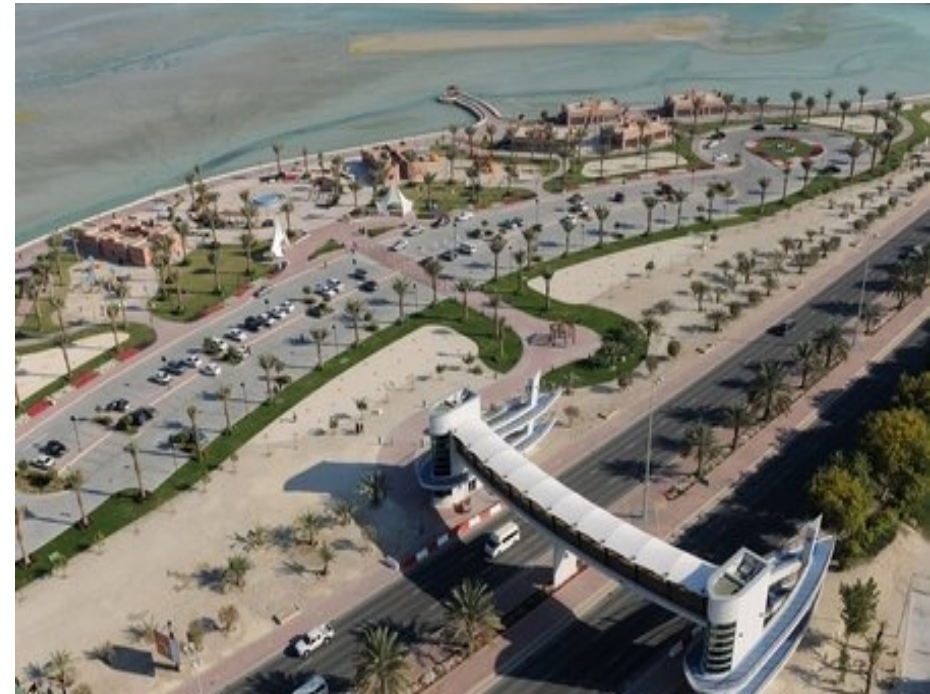
Figure 5: Two bridges connect adjacent neighborhoods across a highway was donated by private companies in Muharraq.

Strategy Planning: Bahrain's National Development Planning Strategy (NDPS) has designated several islands close to Muharraq city as protectorate areas in order to maintain their biodiversity, indigenous planting, and unique psyches. Furthermore, large areas of the sea will be designated to revive the natural pearl industry.