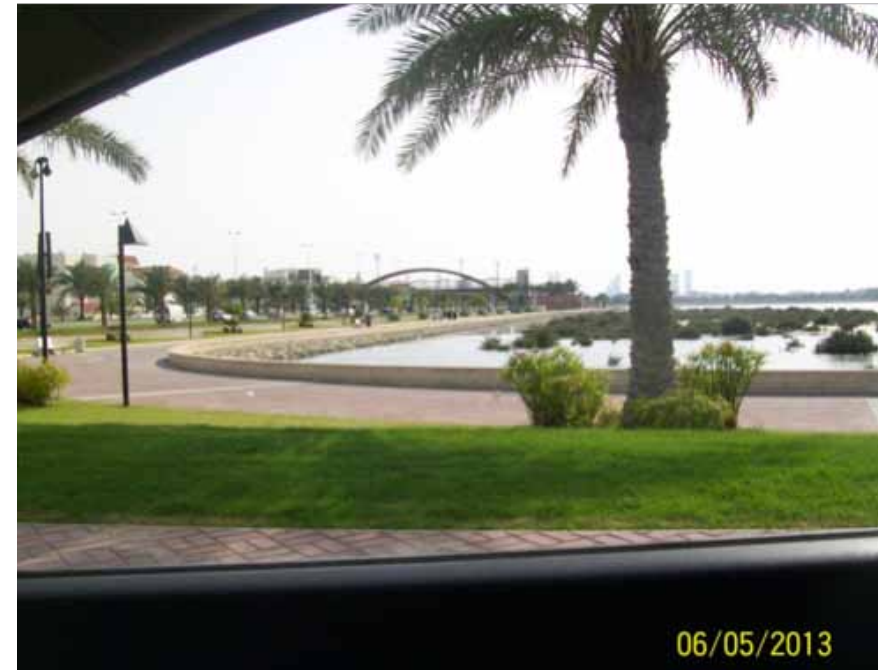
Figure 4: The 3 km long walkway is well - managed and open to the public 24 hours, seven days a week.

Health and Lifestyle: Bahrain has free health care and education services for all residents, through the state's social welfare services. The Ministry of Health also issued various policy directives to encourage a more comprehensive, integrated, responsive and collaborative partnership approach to the population's health - delivered through a National Health Plan. Such plan would shift the emphasis from acute care interventions to community-based programmes promoting health.