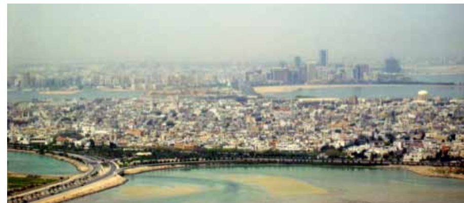
Figure 6: View of Muharraq with the skyline of Manama in the background from Arad Bay

The impact of the land-use on the environment has been taken into account in the enforcement of urban planning settings within all the regions of Bahrain. Urban requisites in planning have been set to reduce environmental damage related to land-use. The livable community of Muharraq has a prominent impact on the urban and economic development of the province and on the role it has been playing in past and present on the Kingdom’s economic life, which comprises many modern economic plants, handicrafts and traditional industries. Developing the existing ‘Dohat Arad’ area yielded several important outcomes. A 3km. public walkway was created, along with additional and recreational facilities. These include a playground, medical facility shops, pedestrian bridges, parking spaces, amenities, lighting and other related services.