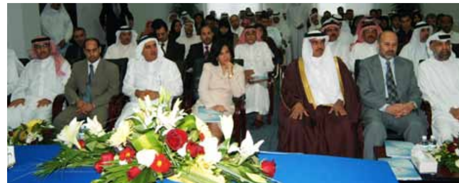
Figure 12: Community participation approving traditional area in Muharraq.

Municipal councillors from each neighbourhood surrounding the project's area met members of the community to ensure that the gardens and facilities provided would be adequately maintained. These are linked through the pedestrian link system with the whole protectorate project. The community is encouraged to take care of the gardens and walkways to ensure positive feedback on cleanliness and order by the public at large. There is also a strong vibrant citizen sector in Muharraq—individuals, families and communities who devote their time and energy to public causes.