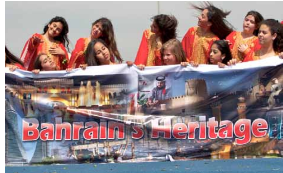
Figure 9: Different ethnic groups celebrating the Heritage Festival in Muharraq.

A high-density population and large catchment area surround the project; thus, there is easy access for all Muharraq residents to enjoy having a place for leisure where they can demonstrate cultural activities including arts, music and dance. Furthermore, the 3km walkway has become an important destination for people who have health problems and for those who walk for the purpose of exercise.