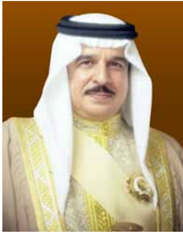
His Majesty the King Hamad bin Isa Al Khalifa The King of Bahrain