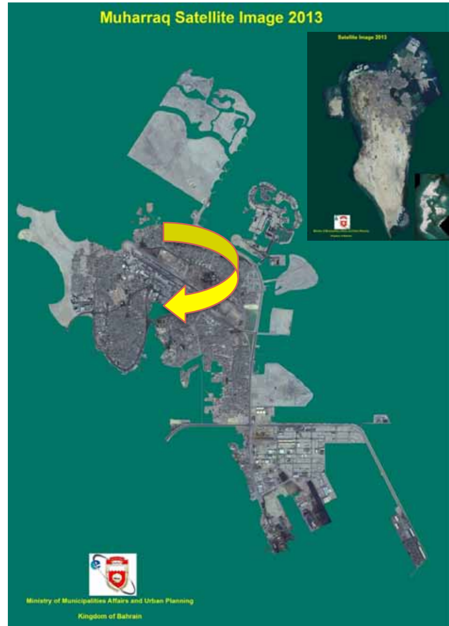
Figure 7: Location of the Project which is close to the traditional town and large catchment area of Muharraq Town- Bahrain

Muharraq has a population of 189,114 inhabitants who represented 14.3% of the Kingdom's total population in Bahrain in 2010; with an area of over 59 sq.km. Population is projected to reach 384,000 by 2030.