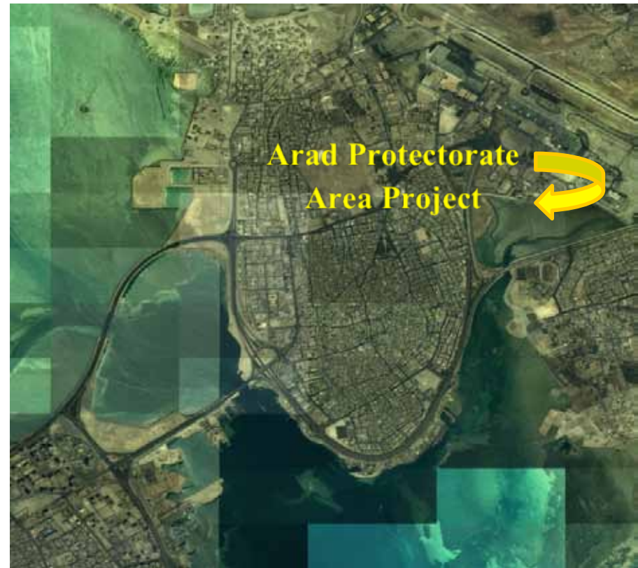
Figure 1: Location of the project which is close to the traditional town and large catchment area of Muharraq.

Enhancement of the Natural and Built Landscapes: Due to low rainfall and land scarcity, there is no large abundance of greenery in Bahrain. Muharraq currently has 0.5m 2 per capita ratios, higher than that of the Kingdom as a whole, which is at 0.3m 2 per capita. This was achieved through planting the streets with trees and palm trees, as well as increasing the number of gardens and parks.