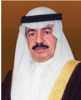
His Royal Highness Prince Khalifa bin Salman Al Khalifa The Prime Minister