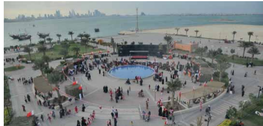
Figure 10: Creating open space for gathering and celebration events close to the beach.