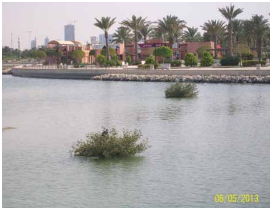
Figure 2: Transformed the neglected bay into a clean natural park for marine plants, fish and migratory birds.

Environmental Best Practices: Several best practice and environmental initiatives have been carried out recently in Muharraq City. The first of these is an initiative related to the project Signature Bahrain. It has started a movement to support the environmental organisations and individuals who are making a difference to Bahrain's environment; where place and memory of sea and fishing life are precious to the community.