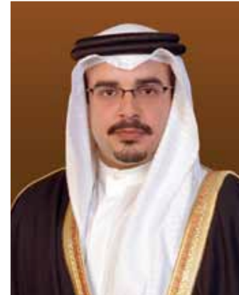
His Royal Highness Prince Salman bin Hamad Al Khalifa The Crown Prince and First Deputy Prime Minister and Deputy Supreme Commander