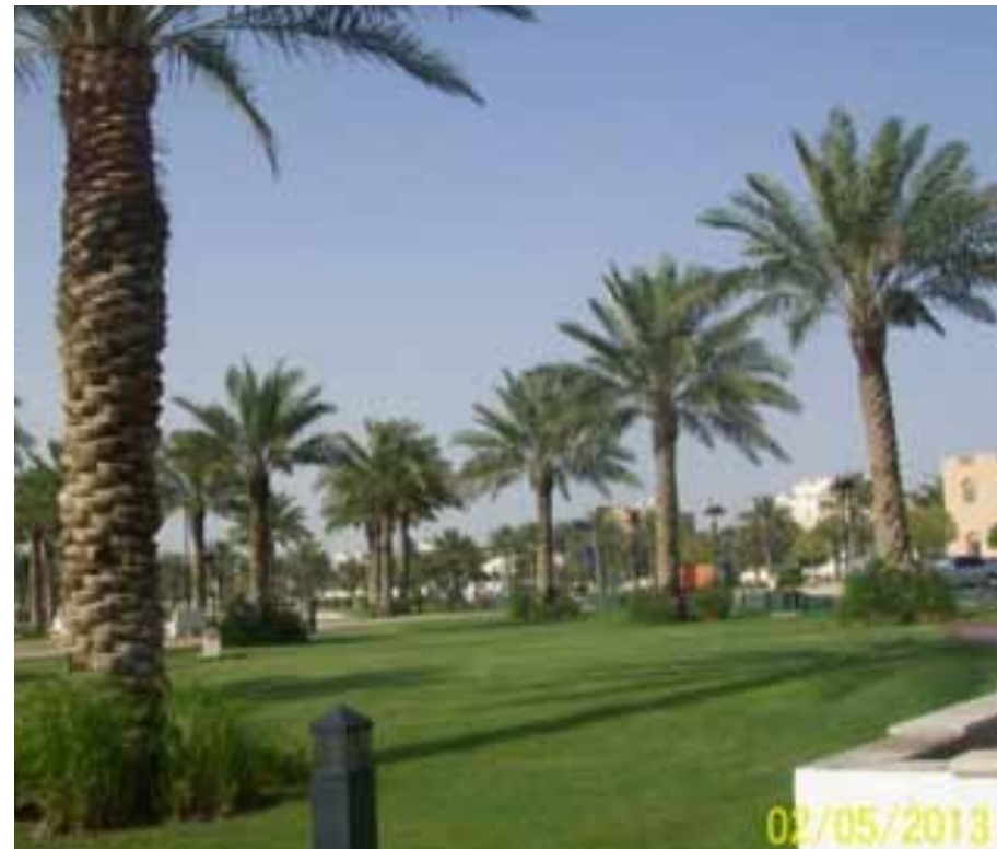
Figure 8: Such landscape in harsh climate is available thanks to recycled treated water.

to produce a sustainable countryside for community policies, especially those close to the waterfront. Furthermore, in order to treasure the area's history, roots and traditional practice, the municipal council has adhered to the public's wishes and renovated the fishery ports in Muharraq. Traditional places that live in memories are precious to the community, and thus have been protected.