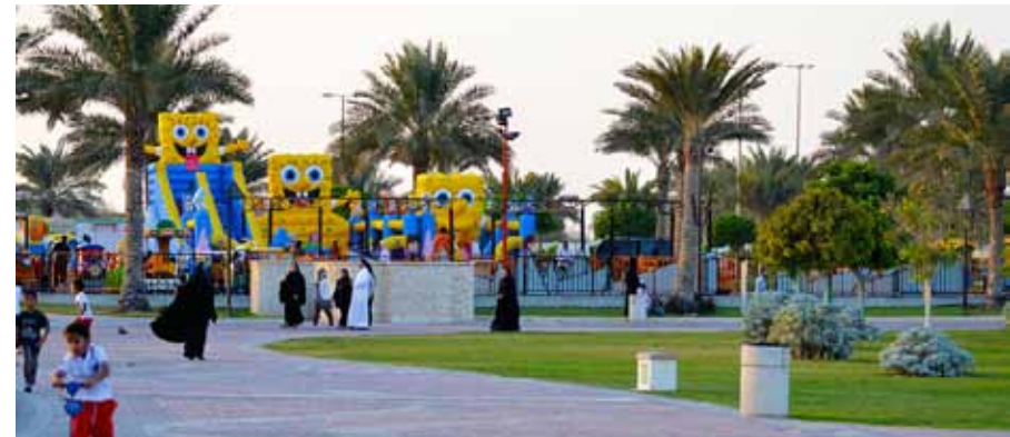
Figure 14: The project provides daily walking habits and activities.

Furthermore, almost two-thirds of adults in Bahrain are either overweight or obese, which can lead to cardiovascular diseases, cancers and diabetes. The combined burden of these diseases is challenging to the country. The Arad Bay project provides an opportunity and a place for children from many schools across Muharraq to exercise and enjoy playing outdoors in the fresh air, while simultaneously being a suitable place for adults to exercise. The Ministry of Health and the Ministry of Education created a joint committee in order to monitor health promotion at schools. Other programmes include: