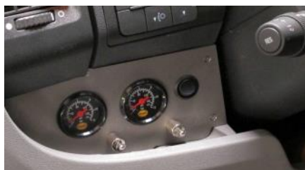
Car specific control panel CS Set