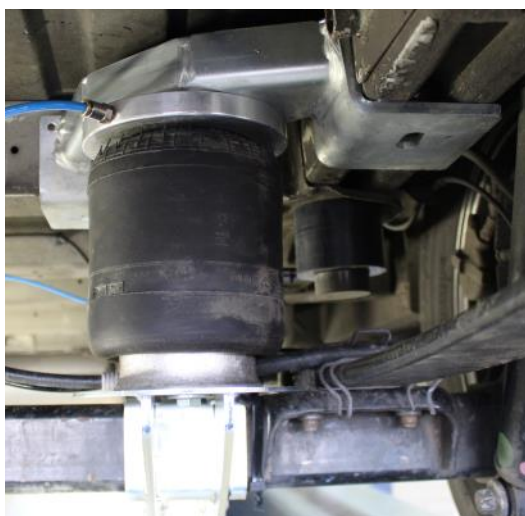
NR-137904 Air Master Ultra

75% of the comfort of a full air suspension for less than half the price !