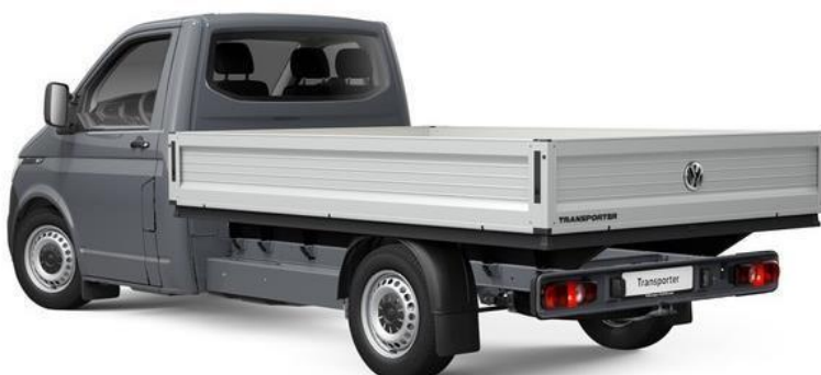
Transporter Chassis Cabin