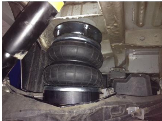
Full Air Suspension