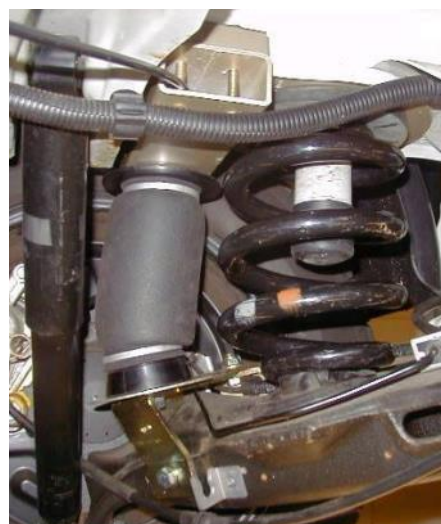
Auxiliary Air suspension