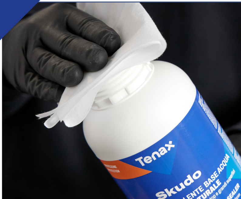
Dampen the cloth