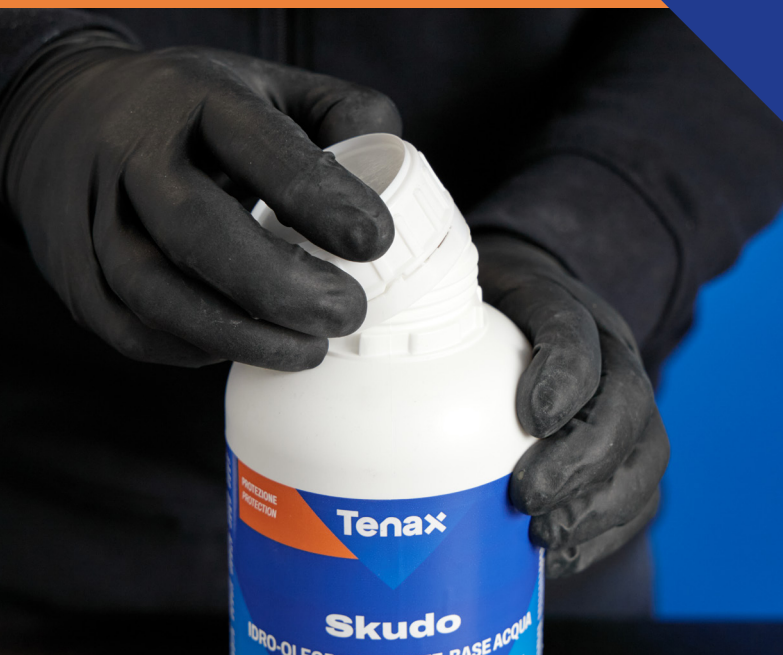
Opening the can