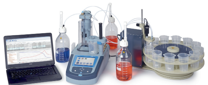
System setup illustration with AT1000 Series Titrator and AS1000 Sample Changer

AS1000 Sample Changer multi-parameter automation solutions release operators' time from cumbersome repetitive analyses for more valuable tasks that cannot be automated.