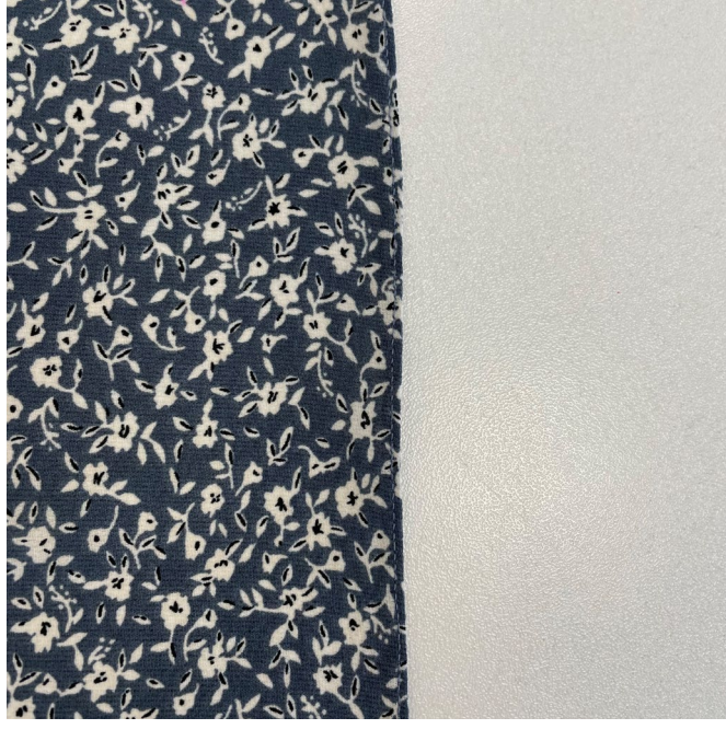
Pin hem Use the sewing machine.