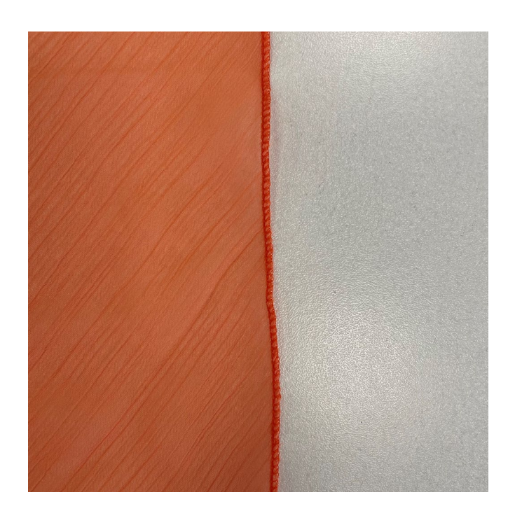
Rolled hem Use the overlocker.

IMPORTANT! When cutting out the flounces, trim off the seam allowances along the outer edges since these edges remain raw. In case you'd like to finish the flounce edges, leave a 1 cm (3/8") seam allowance and choose one of the following ways: