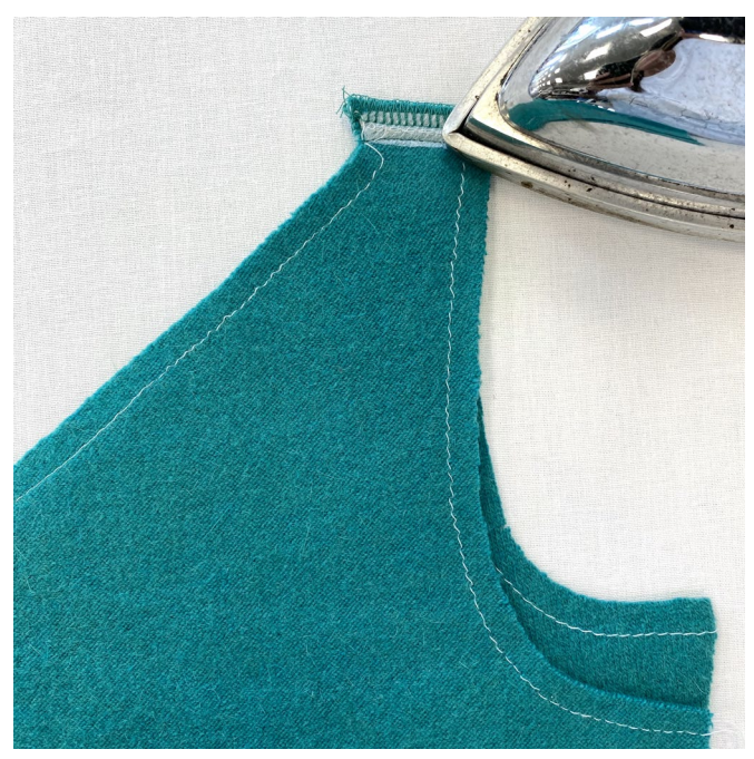
Press the seam flat.