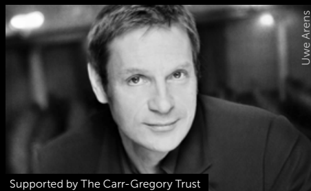
Supported by The Carr-Gregory Trust