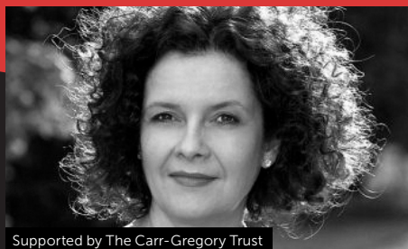
Supported by The Carr-Gregory Trust